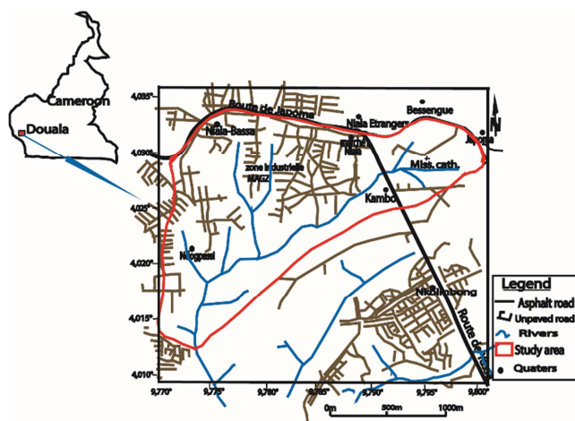
Figure 1. Location of study area.

Water sample collection campaigns for the various physicochemical analyzing took place in two phases. Twenty five water samples were collected from four sources and 21 wells in February 2013 and August 2013 corresponding to the dry season and the rainy season respectively.