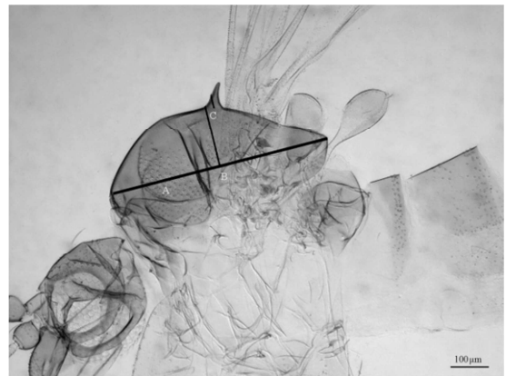
Figure 2. Morphological anomaly in the scutum of Lutzomyia diabolica (male) from Nicaragua. A: length of thorax; B: midpoint on the thorax; C: distance between the midpoint of the base of the spine and the midpoint of the thorax.

segments is a character that can assist in the diagnosis. In both species, we can observe a distinct pigmentation between the scutellum in Bi. olmeca bicolor (Figure 1) and Lu. diabolica (Figure 2). Although the pigmentation of the scutellum is different in the two species, only this character in the thorax is not the only one to distinguish them, since both species have other characteristics belonging to their respective genera. In this male specimen, unlike in our female Bi. olmeca bicolor female, the spine was longer (60.4 µm) and measured 35.1 µm in the middle region of the scutum, with the convexity directed towards the posterior region of the thorax (towards the scutellum) (Table 1; Figure 2).