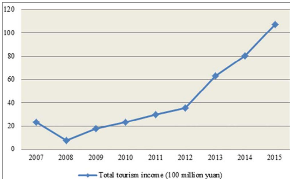
Figure 1. Statistics on the Total Tourism Revenue of Ganzi Tibetan Autonomous Prefecture (Source: Statistical Communiqué on National Economic and Social Development of Ganzi Tibetan Autonomous Prefecture, 2007-2015).

(Source: Statistical Communiqué on National Economic and Social Development of Ganzi Tibetan Autonomous Prefecture, 2007-2015)