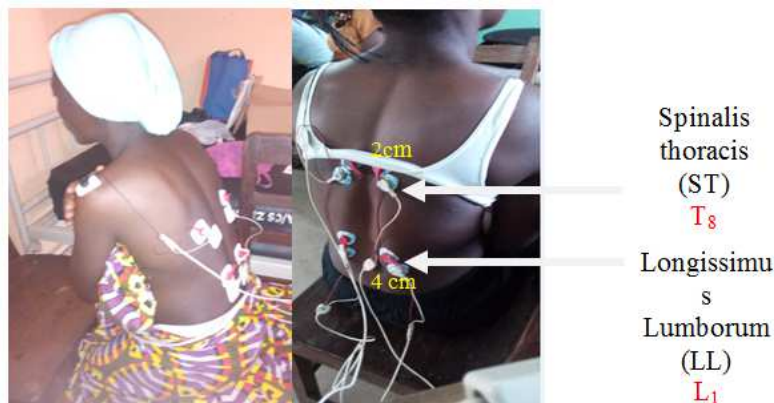
Figure 1. Electrodes positions to record.

The woman was placed in flexed seated position, \approx 20^\circ of trunk flexion from vertical, EMG electrodes were placed bilaterally, 2 cm from the spine at the T8 level for the Spinalis Thoracis and 4 cm lateral to L1 for the Longissimus Lumborum muscles (Figure 1). The test consisted of holding the trunk flexion position with the arms crossed over the shoulders for 60s (Figure 1). Total energy spectrum and RMS were recorded to determine the percentage of fibers recruited.