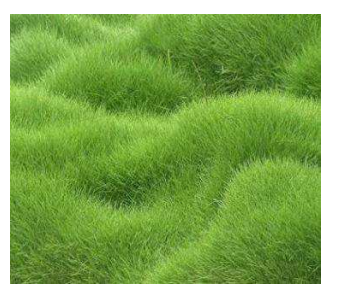
Figure 5. Cynodon dactylon (Durva). [29]

The plant leaves are locally available and are used for making natural antibacterial bandage. In the current research a comparative analysis had been done for selecting best antibacterial agents for making antibacterial bandage.