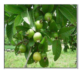
Figure 2. Psidium guajava linn (Guava). [26]