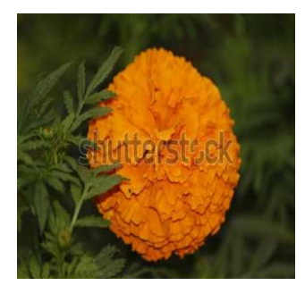
Figure 3. Calendula officinalis (Marigold). [27]