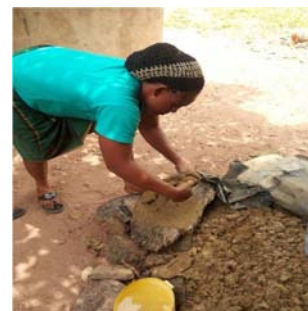
Figure 3. Storing after the extraction.