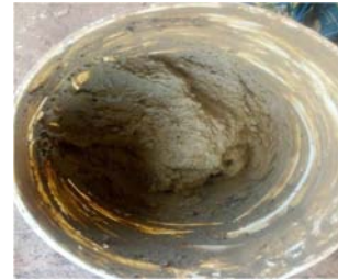
Figure 6. Soaking in container before kneading.