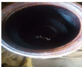
Figure 25. After mixing (final stage).