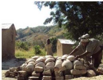
Figure 22. Arrangement for firing.

leaves are placed on top and side of the pots the potters ensure that the pots are well cover and the fire is hit. The fire is always set or arrange depending on the size and types of pots to be fire.