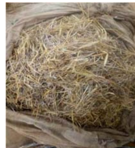
Figure 20. Grass for firing.

The firing materials are firewood, dry banana leaf, paddy, thatch, husk, bamboo, stubble ashes, cow dung and grasses, or false grain. Firewood are obtained from the bush, other materials are obtained from the respective areas.