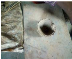
Figure 10. Base formation.