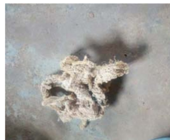
Figure 13. Old sack use for smoothing.

This is when the potters used an old local sponge made from sack bag soaked inside water use in smoothing the surface and then leaves them to dry under sun.