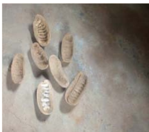
Figure 17. Shell use for decorating the rim.