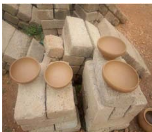
Figure 18. Sun drying.

After the fashioning of the vessel or pots they are expose to sun light during the dry season (December-April) is dry within 2-3 days but at that period the pots are place under the shade to avoid direct heat so as not to cause damage from the over heat. While during the rainy season is place under the sun at this period is belief that sunlight is not as high as that of the previous month.