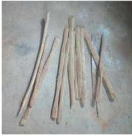
Figure 14. Bamboos use for designing.