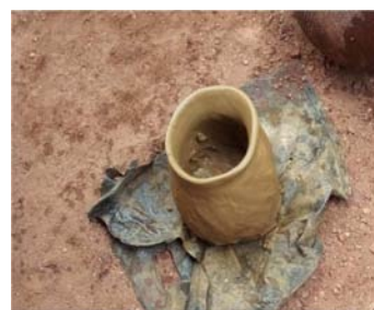
Figure 12. Neck formation.