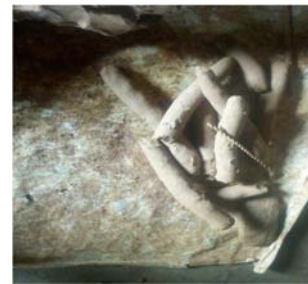
Figure 8. Moldings elongated before fashioning of vessels.