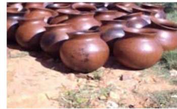
Figure 27. Painting pots.