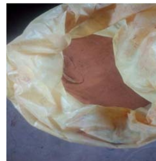
Figure 2. Storage after sieving.

Clay is stored either outside the house or inside the house depending on individual or group, the clay could be bag or put in a bowl and cover it to avoid hardening for ease preparation or mixing.