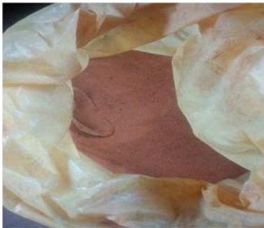
Figure 4. Storage after Pulverization.

The clay is pulverized with wooden pestle after which the clay is been sieve.