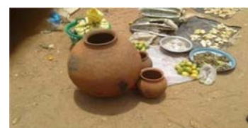
Figure 28. Displaying of pots at weekly market.