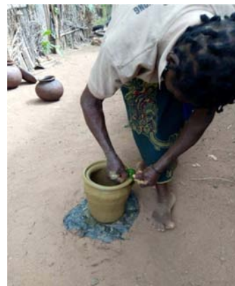
Figure 11. Forming of the rim.