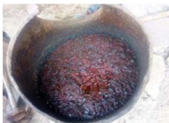
Figure 24. Colouring Before mixing.

Another kind of decoration involves the use of sign and symbol such as dots, flower drawing, slashes. It is done by dipping the potters fingers into the prepare colour or dye and draw a curve lines. According her Yala potters paint or dye the whole of the pots with pigment extracted from Yede . After being colour the pots are allow to dry.