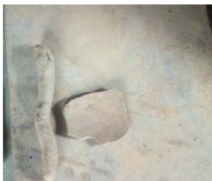
Figure 9. Elongated mold and old clay for base.

The potter take a sizeable quantity of clay from the heap of clay kept for use, the quality of clay to be detached is determine by the size and shape of the base to be prepared. It is now transformed into some rolls. The roll is again transformed into elongated flat mass by beating with anvil. Circle outline is given to this mass out of its elongated shape by slicing the corners with the slicer. In a similar way circular clay plate can be done the same depending on the need of potters and after this she start making some thick and round clay plates or pot with her hand by using the beater.