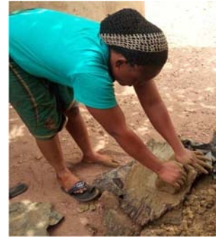
Figure 5. Kneading process.

Kneading is the final stage of the clay preparation. Kneading depend on the choice of the potters. Kneading is done either by hand, wood or by bamboo at the process of kneading dried husk is been sprinkling on it. It is a continuous process until the potters get the desirable texture and preserve it softness and wetness by covering the clay by wet gumming bags. After kneading the clay is divided or sheared into section and are separately place on a wooden platform for the formation of pot.