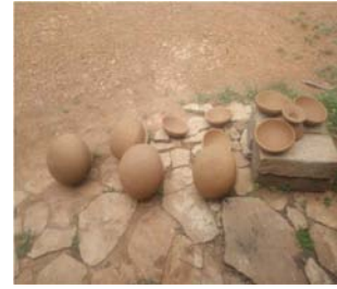
Figure 19. Sun drying.