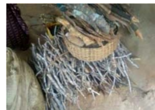
Figure 21. Firewood.