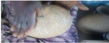
Figure 15. Designing stage.