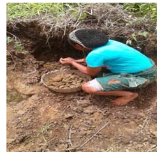
Figure 1. Potter collecting clay.

The clay is collected at the brink of the river bank. At the process of collecting the clay the potter dig to some level either 20cm or 40cm pit with shovel, hoe, knife or spade until she get a required clay, the collection of the clay is very difficult and hard. After removing the clay is then taken to the home with either basket or bowl it could be the potter herself or the children.