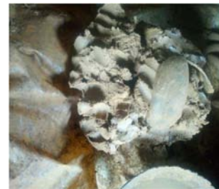
Figure 7. Final stage of kneading.