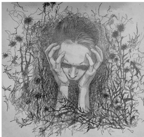
Figure 3. Ekaterina Poltavskaya ("Grief", 2022, paper, pencil).