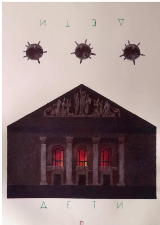
Figure 4. Oleksiy Revika ("Children", 2022, paper, ballpoint pen).