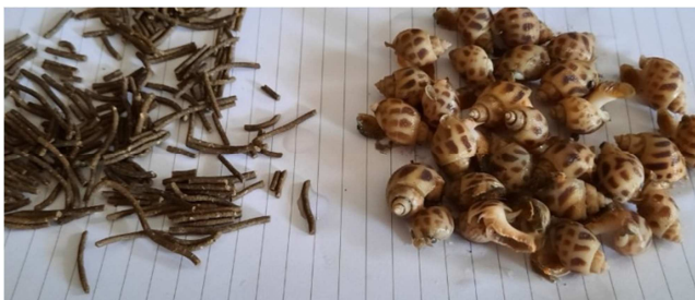
Figure 3. The formulated pellets fed to Babylon snails.

The formulated pellets were fed to the snails once a day in the morning at a feeding rate of 1.2% of snail body weight in the beginning and gradually reduced to 0.8% in the late period. The pellets were delivered evenly to the bottom of the ponds and the tanks by hand. Each week, all snails were starved one day for cleaning the culture tanks as well as ponds.