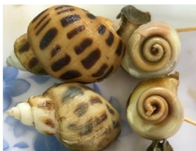
Figure 4. Typical appearance of the steamed shells and soft body of harvested snails from RAS tanks (lower) and ponds (upper).