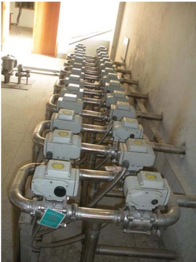
Figure 6. Conversion valve group.

Today most large scale distilleries begin to use the automatic blending control system to improve production efficiency and production capacity [5].