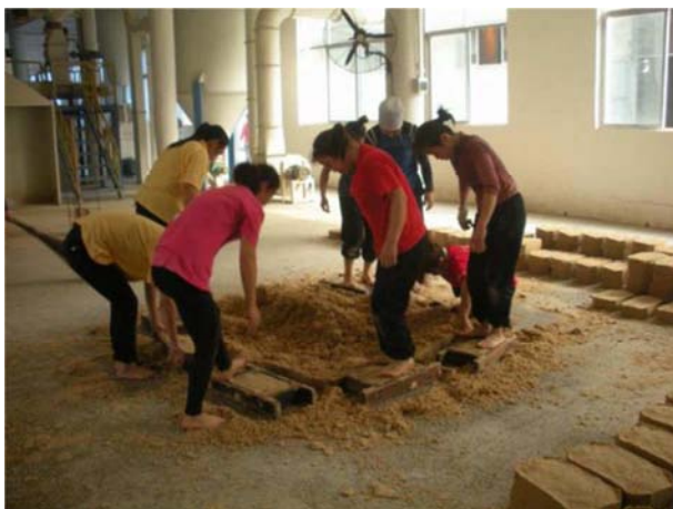
Figure 1. Stampede.

The raw materials of the big size koji are mainly wheat, barley, plus a certain percentage of peas. The feedstock is added with right amount of water. After kneading the Koji feedstock is then stampeded into a larger size block by specialized workers. So this kind of koji is called big size koji. Stampede is a difficult and interesting work. The workers are strictly specified in their works. The stampede and De-moulding method is shown in Figure 1 and Figure 2. Some people devoted to the measurement of feedstock and water, some specialized to mixing of feedstock, some specialized in putting raw material into the wooden mould and trampled. After de-moulding, the blocks are moved to the breeding room.