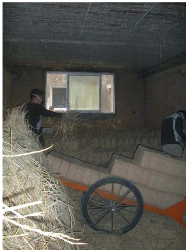
Figure 3. Placement of the koji block in breeding room.

Higher fermentation temperature of koji is one of important reasons that the spirit produced with big size koji can get intensified aroma.