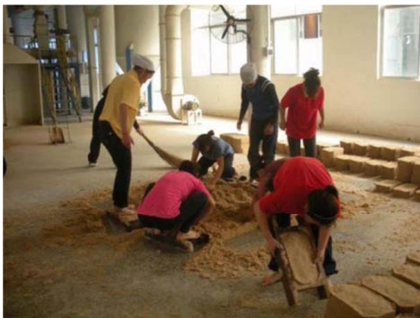
Figure 2. De-moulding.