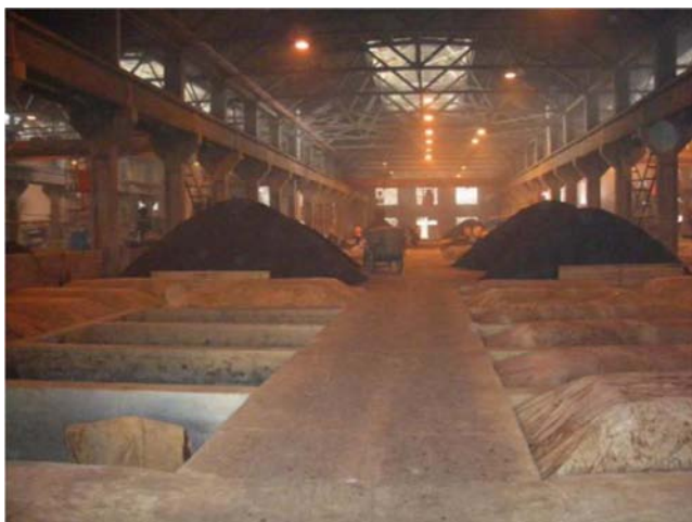
Figure 4. Mud pit, the fermentation vessel for intense-flavor spirit.

The diversity of the fermentation containers is also one of the main factors to contribute to the difference in spirit flavor. There are mainly two types of traditional fermentation container: pottery jars and cellar. Pottery jars are sub-divided into the type buried below ground and the type placed indoor.