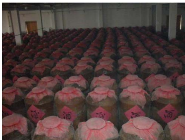
Figure 5. Storage in pottery jars.

The taste of newly distilled spirit has a spicy sense and other unpleasant odors because of the presence of some sulfide. The new spirit must be stored in pottery jars for maturation. After maturation, the composition of flavor substances is improved and the taste of the spirit becomes mellow and smooth. Finely the matured spirits are blended to yield varied final products each with distinct and unified flavor. The storage and ripening container is shown in Figure 5.