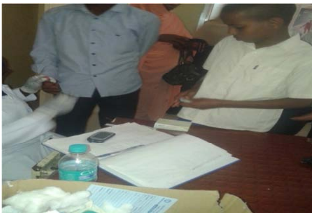
Figure 2. Blood glucose and HbA1c monitoring for participated children.