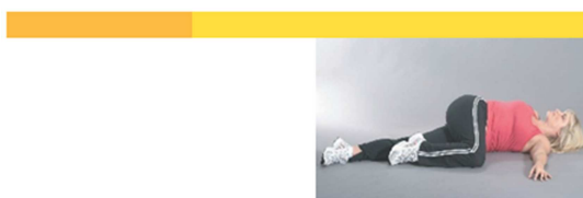
Figure 2. Trunk Twist: Improved flexibility.