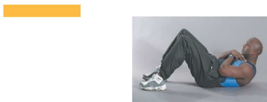
Figure 1. Curl-Up: Improved strength and endurance in the lower back and sides the abdomen.