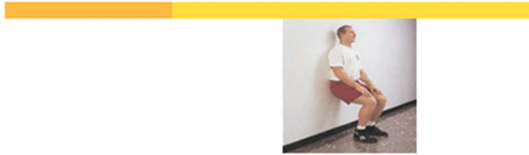
Figure 3. Wall Squat (Phantom Chair): Increased strength and Endurance in the lower back, thighs, and abdomen.